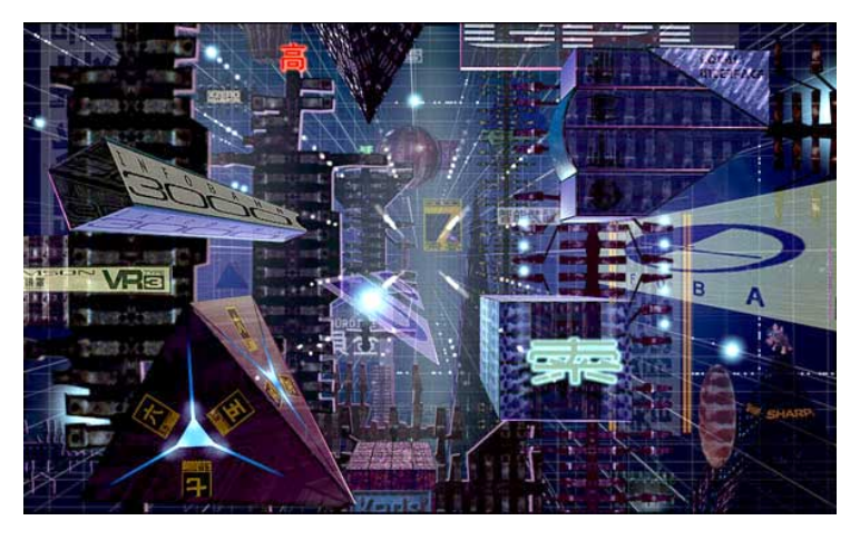
Johnny Mnemonic (1995)