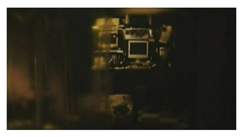
Pulse (Kairo) (2001)