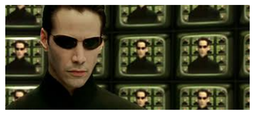
The Matrix (1999)