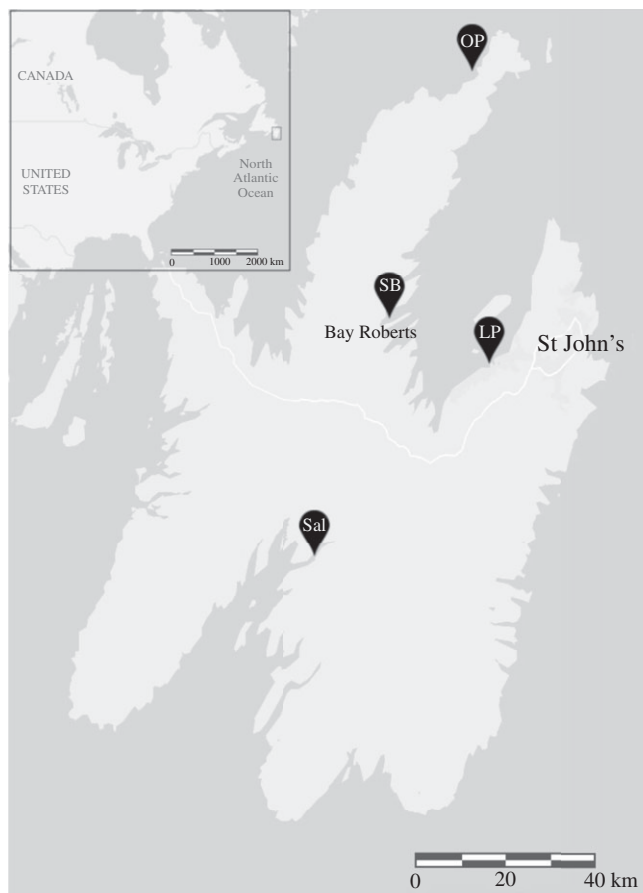
Figure 1. Locations of the four colonies studied in Newfoundland, Canada. The Long Pond (LP; 47°31′09.8″ N, 52°58′33.6″ W) and Spaniard's Bay (SB; 47°35′51.8″ N 53°16′48.7″ W) colonies are situated in urban environments, whereas the Old Perican (OP; 48°05′15.7″ N 53°01′20.6″ W) and Salmonier (Sal; 47°08′11.0″ N 53°28′48.6″ W) colonies are situated in more remote areas. All colonies are connected to the mainland by a sandbar, except for Old Perican which is an island situated 600 m from the mainland. All colonies are bordered by the Atlantic Ocean.

We haphazardly targeted incubating gulls and captured them from the nest using a hand net or noose trap over 3 days at the Long Pond colony, and over 2 days at the Spaniard's Bay, Old Perican and Salmonier colonies. Our goal was to capture and band one or both adults from at least 40 nests per colony, though this was only possible at Long Pond ( N=46 individuals from 43 nests) and Spaniard's Bay ( N=40 individuals from 40 nests), which were the largest colonies (estimated to be greater than 300 pairs each at the time of the study). The Old Perican and Salmonier colonies were smaller (less than 150 pairs each at the time of the study), and we could only capture 22 and 25 individuals (each from a different nest), respectively. In general, the gulls learned quickly to avoid us, which made it difficult and increasingly disruptive to capture additional individuals or the mates of those already captured. Although we targeted gulls with unhatched eggs at capture, some nests hatched during the following days of testing. In all cases, all testing was complete before the chicks became mobile and ventured out of their nest cup (less than 7 days old [50,51]).