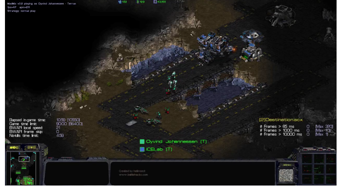
Fig. 1. SSCAIT live stream running in HD resolution and controlled by the custom observer script [9].

The activity of bot programmers and the general public surrounding SSCAIT has grown considerably over the course