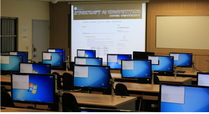
Fig. 5. The Tournament Manager Software running in a computer lab for the CIG competition, which distributes bot games to multiple machines.

vulnerable to the human ability to quickly identify bot patterns and behavior, and exploit this quickly during a match. For example, one human player during a human vs. machine match noted that one bot unit would chase his Zergling when it got close to the bots' units, and proceeded to run the Zergling next to the bot army, and then lead the bot on a wild goose chase throughout the entire map. The entire time, the bot may have been reasoning that its army could win the fight against the single Zergling unit, while not realizing that the human was just buying time until its army was ready for the final attack. This also illustrates one of the biggest challenges in all of artificial intelligence: understanding the long term effects of actions which have delayed rewards. An expert human is able to quickly understand that they are being exploited in such a way, and that it will have negative effects down the road, and is able to stop the behavior. This long-term vision that is so intuitive to humans remains a problem for current RTS AI.